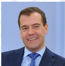
Dmitry Medvedev Prime Minister of the Russian Federation